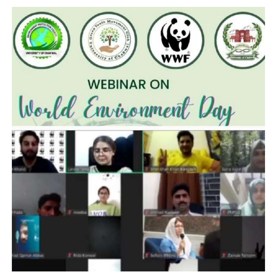
Fig. 1.9: Webinar on World Environment Day

On June 10, 2024, the Environment Protection Society celebrated World Environment Day by organizing a highly anticipated webinar. This event brought together distinguished speakers from various fields, all sharing their insights on environmental conservation and sustainable practices.