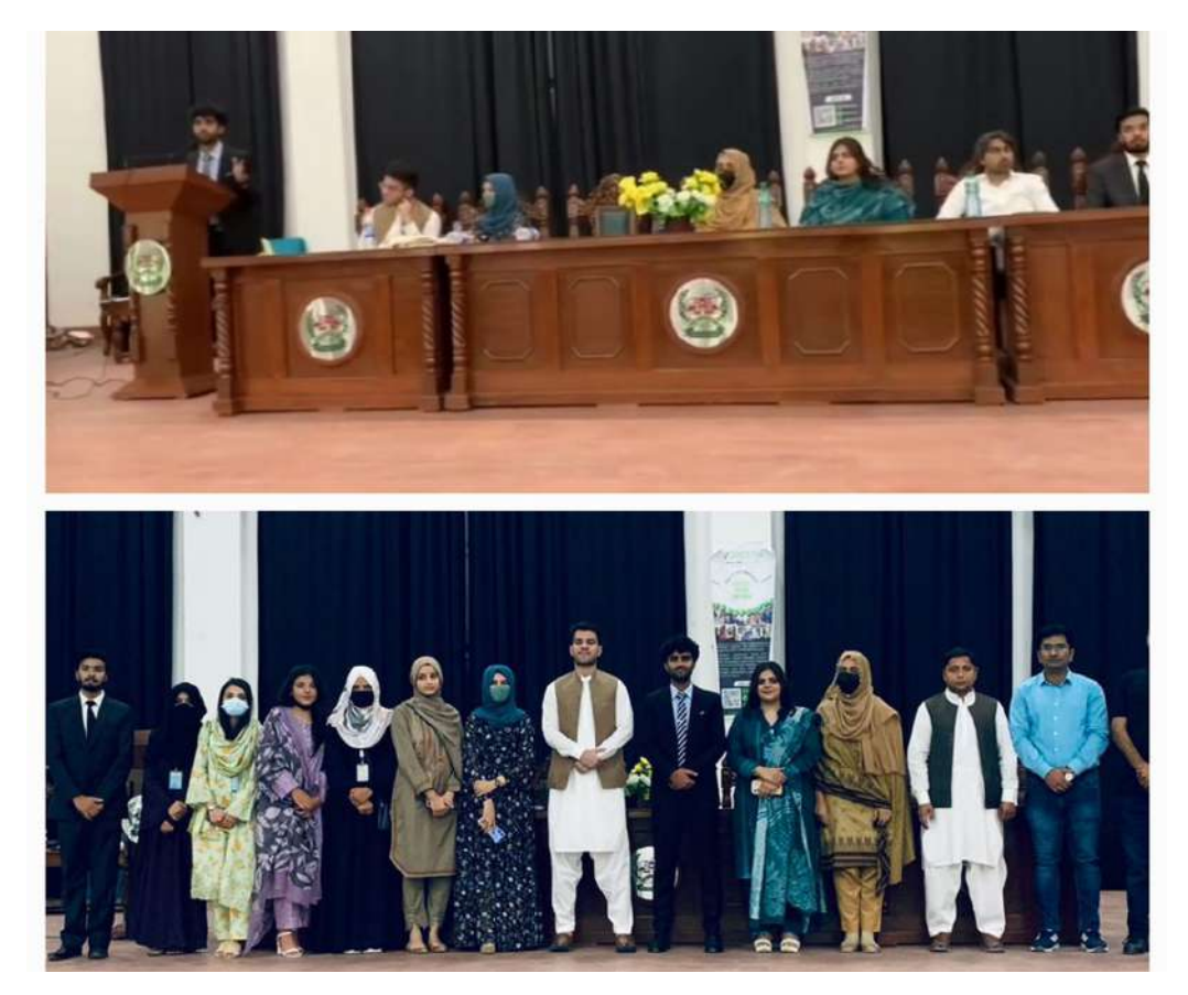
Fig. 1.4: Seminar on climate change, consumption, and future of health through lens of SDGs

The Environment Protection Society, in collaboration with VGreeno and MBK Well-being Society at the University of Chakwal, hosted a seminar titled "The Great Disruption: Climate Change, Consumption, and the Future of Health Through the Lens of SDGs" on May 13, 2024.