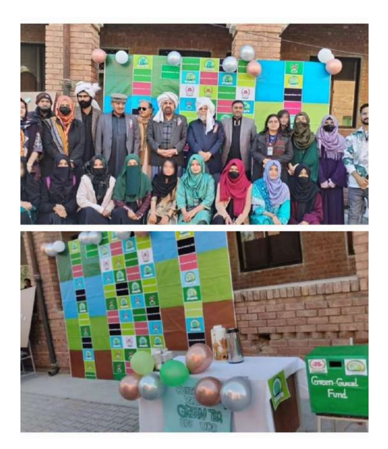
Fig. 1.1: (a) Eco-friendly media wall (b) Green tea stall

Highlighting sustainability, the Environment Protection Society featured an impressive recycled media wall and a cozy green tea stall during Student Festival Week at the University of Chakwal.