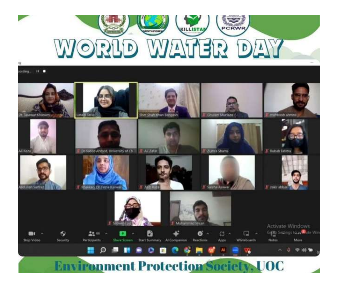
Fig. 1.3: Webinar on World Water Day

In celebration of World Water Day on March 22nd, a webinar was held on March 23rd, 2024, in collaboration with PCRWR and Skilistan. This event fostered insightful discussions, raised awareness, and inspired action towards water conservation and sustainability.