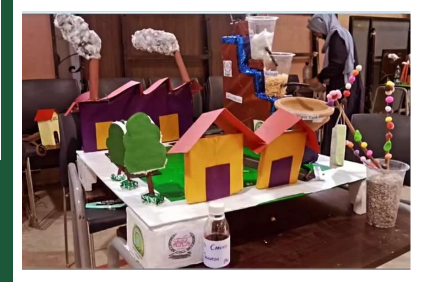
Fig. 1.5: Water Filtration Project

The Environment Protection Society presented their groundbreaking "Water Filtration Project, Green Wave Oasis", at the University of Wah.