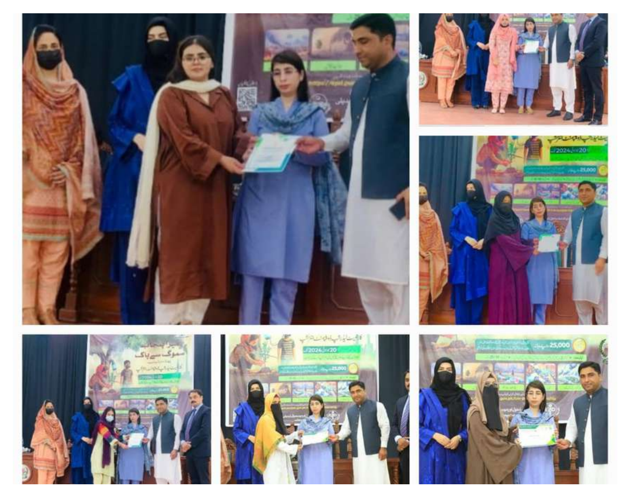
Fig. 1.10: Certificates distribution to executive committee and members of EPS at the seminar of Smog Internship, initiative by Chief Minister

On July 11, 2024, the Universiry of Chakwal's Environment Protection Society hosted a seminar to introduce the groundbreaking Smog Internship Initiative, spearheaded by the Chief Minister of Punjab. Following the seminar, certificates were presented to the executive committee and members of the Environment Protection Society in recognition of their esteemed contributions to environmental protection.