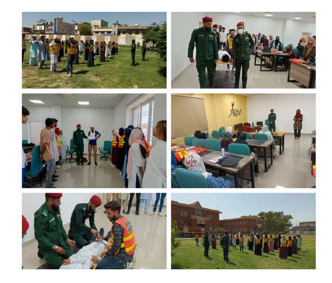
Fig. 1.8: Rescue 1122 Training

The Environment Protection Society, in collaboration with Rescue 1122, organized a comprehensive four-day first aid training session from 21 May 2024 to 24 May 2024. This program aimed to equip participants with essential skills and confidence to handle emergencies effectively and competently.