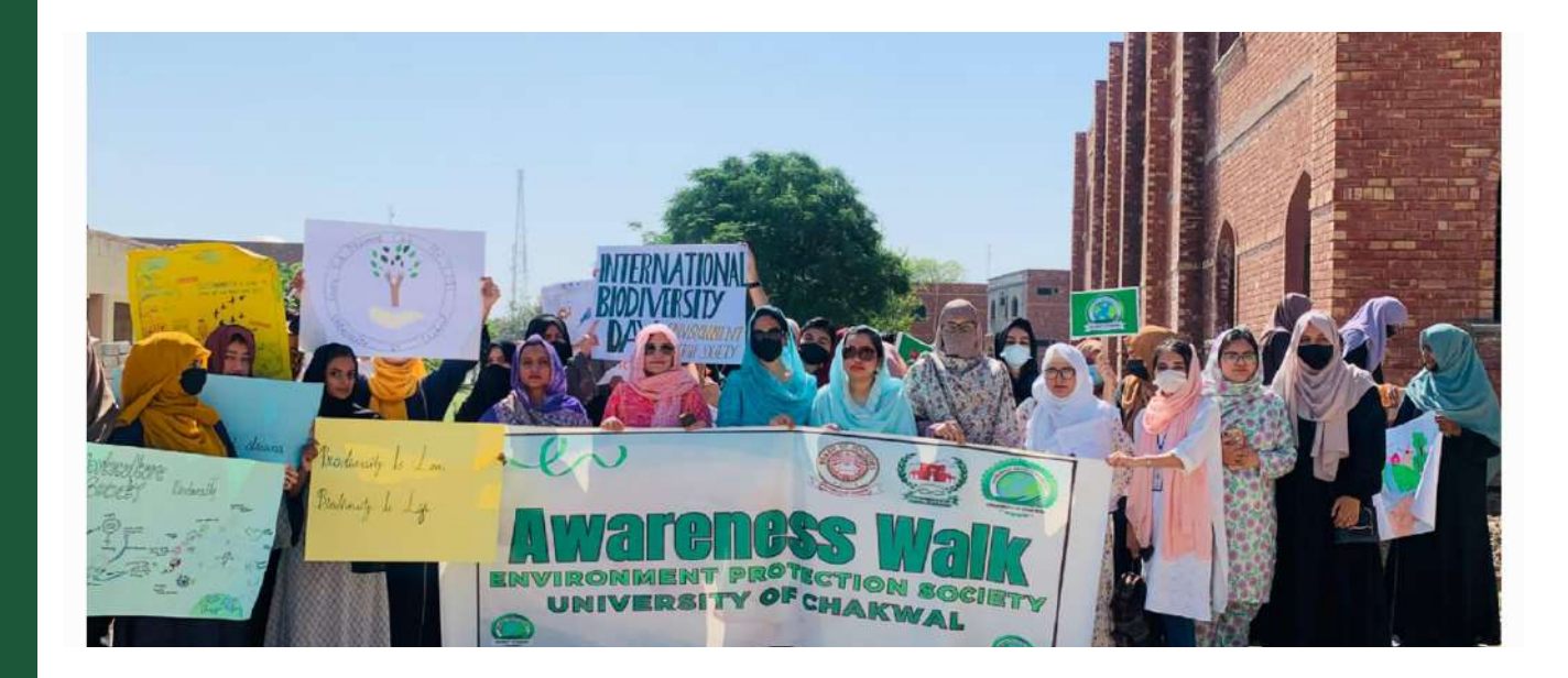
Fig. 1.6: Awareness Walk on World Biodiversity Day

On 22nd May 2024, the Environment Protection Society celebrated International Biodiversity Day with a biodiversity walk to raise awareness about conservation and sustainability while appreciating the beauty of nature.